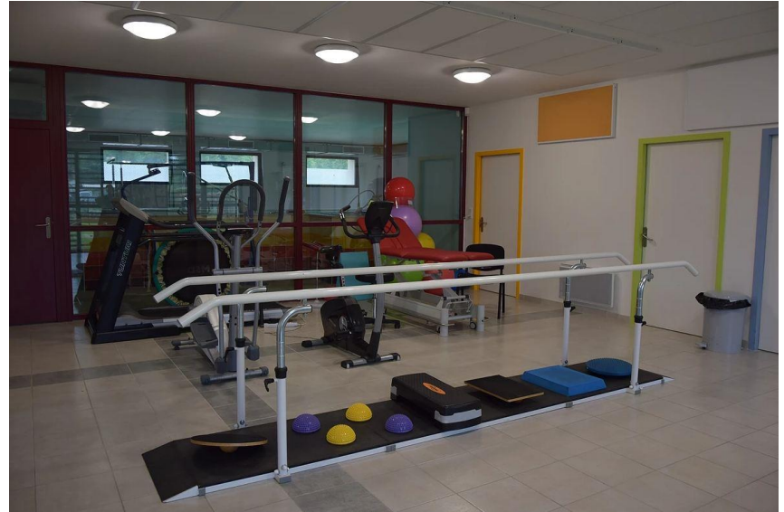
Polyclinic - 2012