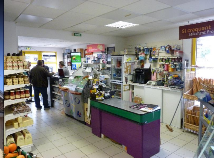
Local grocery store 1996